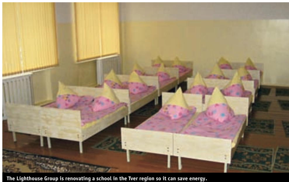
The Lighthouse Group is renovating a school in the Tver region so it can save energy.

it in the Netherlands, it's the best way, and these Russians should do exactly the same as we do. And that is a definite ingredient for failure here. You should really know your limits."